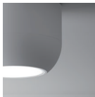
BC Wrinkled white