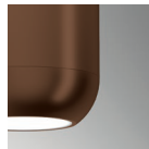
BR Matt bronze